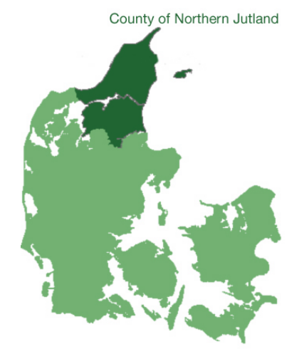
Figure 1: The County of Northern Jutland is app. 6.000 km2 and have 500.000 inhabitants

The decision to appoint the County of Northern Jutland as the digital lighthouse for the rest of Denmark was taken in 1999. The same year the local university (Aalborg University) could celebrate its 25<sup>th</sup> anniversary. The innovative research environment that was a spin-off from the activities at the university had proven to be a strong factor in the local community and even at a regional scale. It had e.g. resulted in a research and development cluster for mobile telecommunication. Also many other branches at the university had proven to be successful at both national and international scale. Together with the fact that many of the local municipalities also had shown a great deal of interest in digital administration, these aspects were the primary reasons for the government to give the region status as a Digital Region.