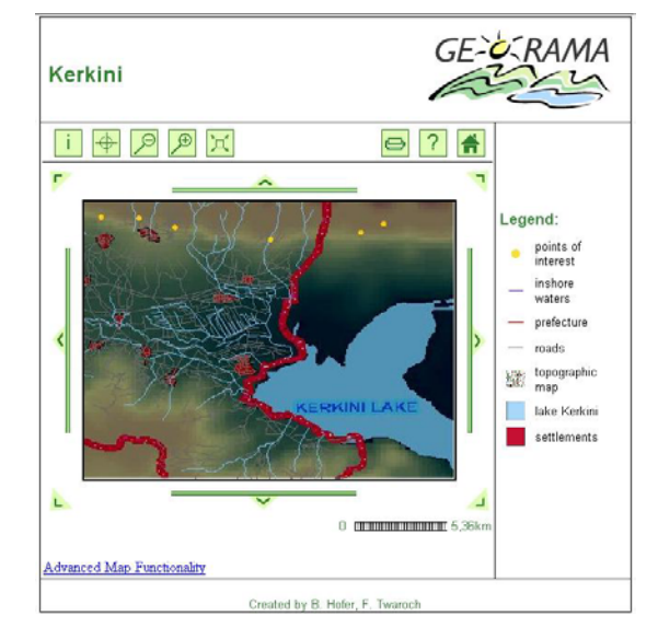
Figure 3: Screenshot of the map viewer prototype showing the WMS of Kerkini (Greece)

The map viewer offers functionality, which is based on the interfaces of web mapping services. The functionality of the map viewer cannot compete with the one provided by proprietary services. Basic interaction operations like zooming, panning, and the recentring of the map are implemented. Information about an object is provided when clicking on it and it is possible to influence the content of the map by adding or removing data layers. Any interaction with the map requires a new server request; because of that the performance of an OGC client suffers. The offered functionality allows people to get an overview over a region, which is the main intent of the maps presented in this project. In addition to that, little experienced map users are not swamped with features. The usability of the map viewer was an important aspect; this led for example to the implementation of multilingualism in the map viewer. Figure 3 shows the prototypic map viewer of GEORAMA.