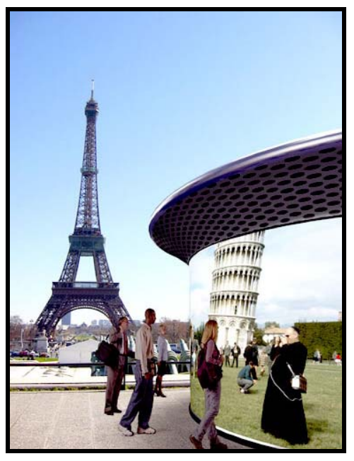
Figure 5: Tholos System, a possible teletransport.

or more cities. The system allows people in public places of different cities to interact in real time and with a real sense of presence (figure 4).