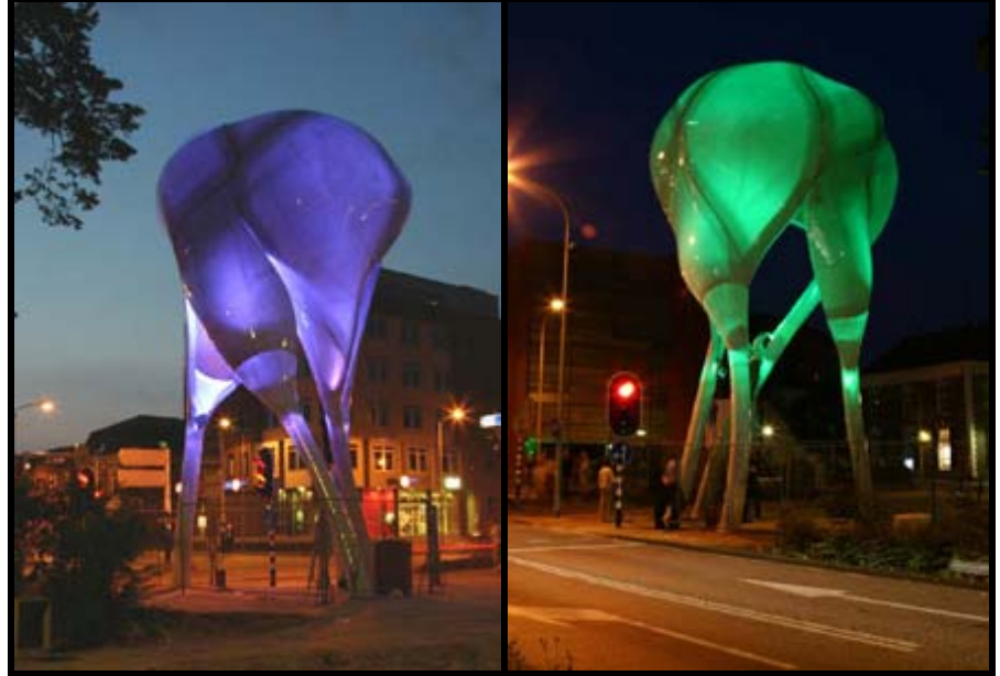
Figure 3: D-Tower, measuring the city's humour.

First, an interesting work of art and architecture that follows this pattern is Lars Spuybroek's intervention for the city of Doetinchem in the Netherlands, called D-Tower (figure 2), constructed between 1998 and 2003 (Cuff, 2003). During these five years, a website surveyed participants' emotions every month to transform their sensations into an unstable and colourful tower in a public square. In this way, passers-by would notice what the artist/architect supposed to be the mood of the city.