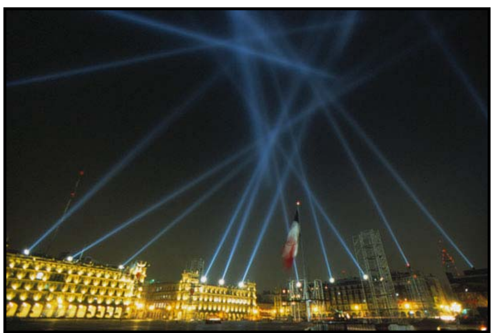
Figure 4: Vectorial Elevation, re-thinking public space.

Secondly, the Mexican artist Rafael Lozano-Hemmer, uses ICTs and interaction as his major instruments for his interventions. His works also assume an augmented, urban notion of transarchitecture: what Brower and Mulder (2002) call transurbanism. In one of his most celebrated works, Vectorial Elevation, Lozano-Hemmer arranged several searchlights on the top of buildings surrounding the Zocalo Square in Mexico City. For about 10 days in 1999/2000, people were able to configure a design through the Internet for the beams of the robotic lights to change every 6 seconds. The result was a vivid dance of lights which could be seen from as far as 15 kilometres (figure 3). Since then, he has repeated this installation in Spain (2002), France (2003), and the Republic of Ireland (2004).