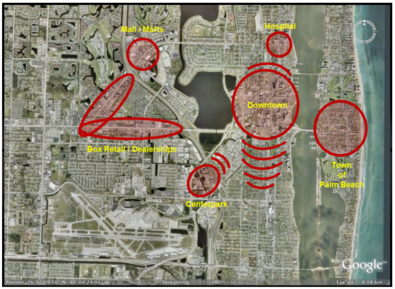
Figure 2: Sub-Nodes within WPB Employment Center

The investigation generated an overall result of: shifting centers and small cluster formations within the overall West Palm Beach node . Moreover, there appears to be six main sub-nodes within the West Palm Beach sub-metropolitan center. Figure 2 shows the six major nodes as well as a more detailed view of districts within the traditional downtown area.