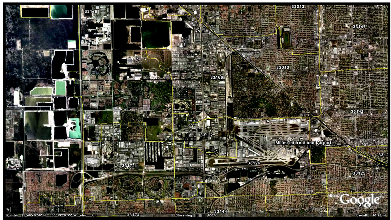
Figure 4: The Inverted T