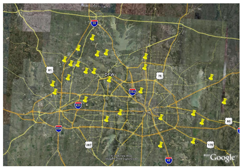
Figure 1: System of Airports in the Dallas-Fort Worth Metropolitan Area (map from Google Earth)

Prosperi (2007) accidentally observed, in studying economic clusters around airports, that there appears to be systems of airports within metropolitan areas. Figure 1 demonstrates this idea for Dallas-Fort Worth. If true, barely addressed questions about the nature of airport mobility nodes arise, e.g., do different nodes in the system have different roles to play in both economic development and innovation. Understanding and/or quantification of these airports systems remains a challenge.