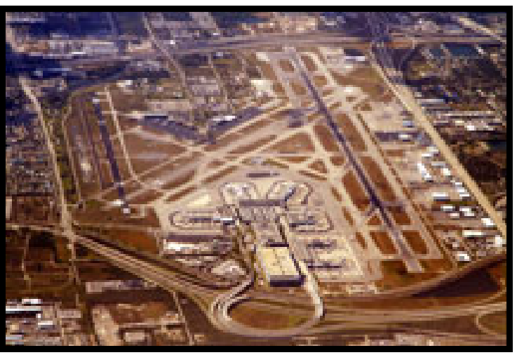
Figure 2: Aerial View of MIA

For the twelve-month period ending December 31, 2006, the airport had 384,637 aircraft operations, an average of 1,053 per day: 77% scheduled commercial, 17% air taxi, 6% general aviation, and <1% military. There are 345 aircraft based at MIA: 7% single-engine, 35% multi-engine, and 58% jet.