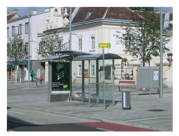
Figure 1 Current Bus Stop, Schwechat, Main Square

Most attempts to design intelligent bus stops are concerned with customary electronic passenger's information systems, e.g. neon writing boards using LED or LCD technology which announce the departure of the next means of transportation and indicate, perhaps, a little additional information or advertisement. Common additional requirements include: ability to orientate, accessibility on foot and on wheels, signposts; bicycle storage facilities; no underpasses, no angst-areas, supervision and help facilities; bright materials, illumination; equipment without barriers, suitable for the handicapped; regular servicing and cleaning. All this is basically a static part of the bus stop with no ability for users to interact with the surrounding environment e.g. other customers, local businesses or communities.