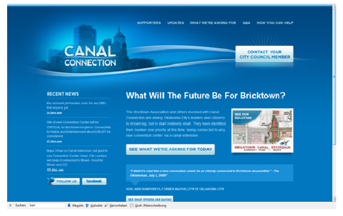
Fig. 9: Screenshot of the main Web site of the bottom-up movement Canal Connection.