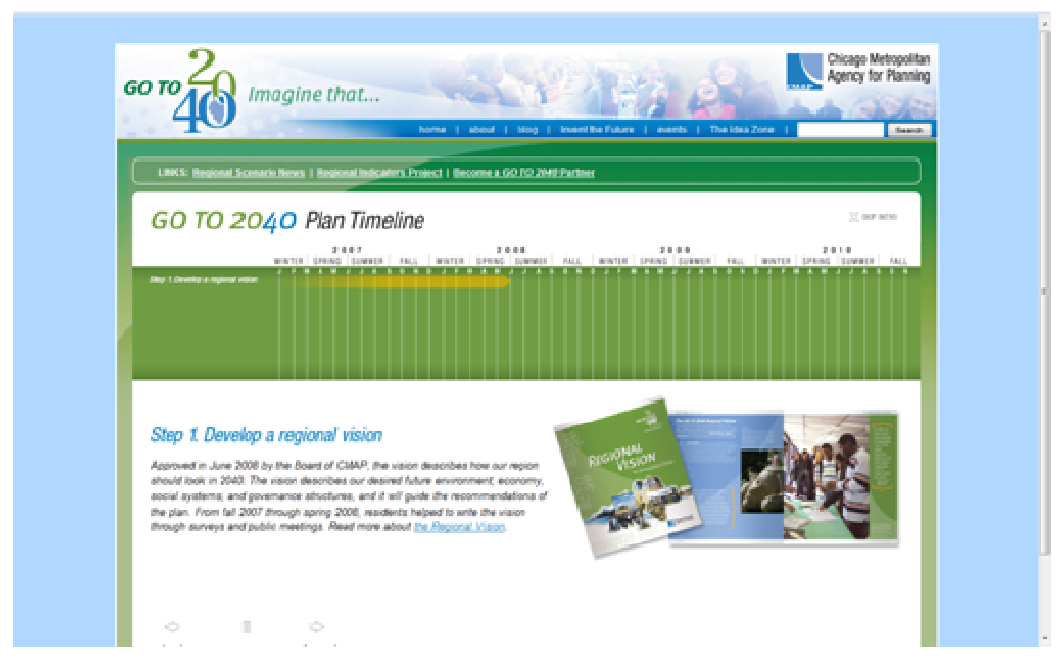
Fig. 3: Screenshot of the main Web site of the GO TO 2040 project

GO TO 2040, the official comprehensive planning campaign for metropolitan Chicago, was launched in August 2009 by the Chicago Metropolitan Agency for Planning (CMAP) and makes extensive use of Social Media to support the planning process. The GO TO 2040 processes aims to "develop a preferred future scenario," which is "based on residents' feedback...and on quantitative analysis of...regional indicators." The preferred future scenario is used to develop strategies for the official comprehensive regional plan for metropolitan Chicago.