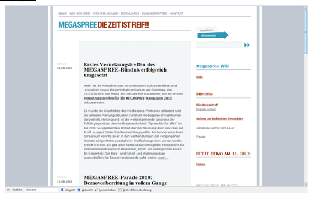
Fig. 7: Screenshot of the main Web site of the bottom-up movement Megaspree.