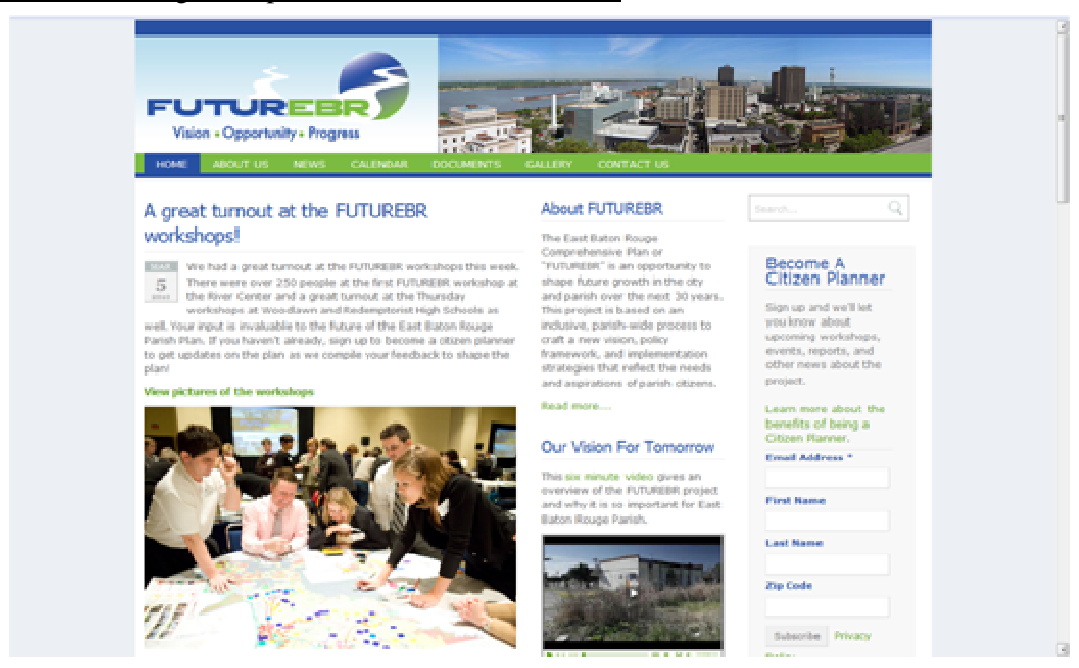
Fig. 5: Screenshot of the project's main Web site

The "FUTUREBR" Web site was launched in December 2009 to support the Comprehensive Planning process for East Baton Rouge (EBR), Louisiana, which replaces the old comprehensive plan. A project of the City of Baton Rouge and the Planning Commission of the City, it seeks "to shape future growth in the city and parish over the next 30 years. This project is based on an inclusive, parish-wide process to craft a new vision, policy framework, and implementation strategies that reflect the needs and aspirations of parish citizens. FUTUREBR will guide the physical development of the city and provide a framework within which