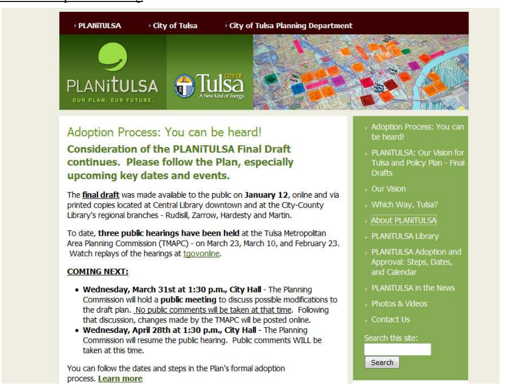
Fig. 7: Screenshot of the main Web site of PLANiTULSA.

PLANITULSA is a project by the City of Tulsa, Oklahoma, to update the city's Comprehensive Plan. The "Vision for Tulsa lays out concepts for how the City of Tulsa will look, function, and feel over the next 20-30 years. This vision is the guiding document for Tulsa's comprehensive plan update, PLANITULSA, and