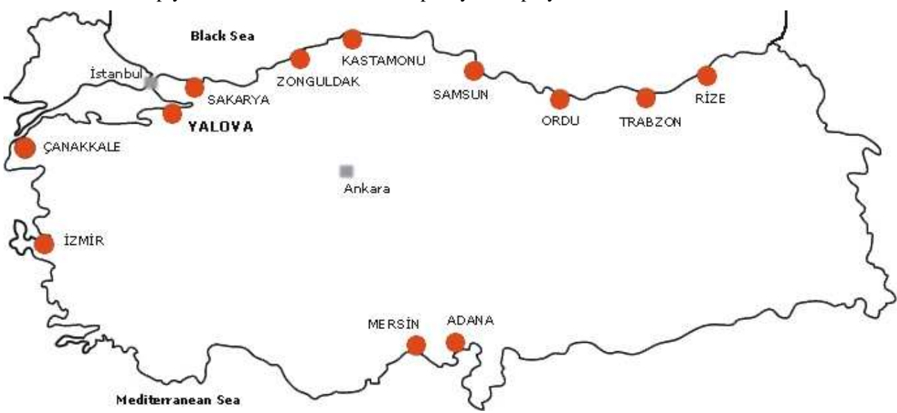
Fig.4: Illustration of new shipbuilding zones in Turkey.

These demands imply an investment which is of capacity to employ around 8000 workers.