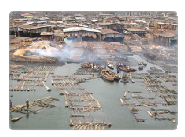
Figure 2: Shanties, wood preservation and blighted conditions of the Makoko end of the Lagos lagoon

Adejumo (2003) suggested that unplanned developmental activities have continued to alter the metropolitan fringes. The depressed national economy encouraged fringe communities to sell landed properties giving room for the growth of slums. He suggested land acquisition by the government which should extend to the fringes to acquire land as green belts serving as buffers that will contain the sprawl on one hand and delineate the urban edge on the other. This further explains the development of slums and shanties along the fringes of the Lagos lagoon.