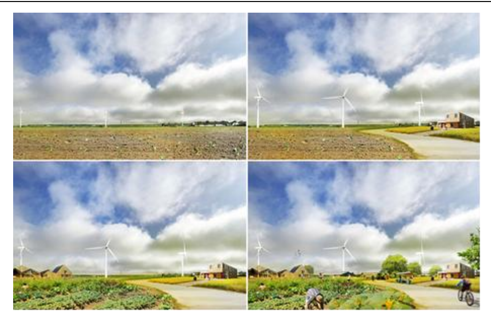
Figure 3. The intended step by step transformation of current Almere Oosterwold (top left) to the rual –urban area (bottom right) over the next 20 years.

In 2011 we were challenged to by the susidiary Almere Oosterwold to support them with elaborating strategies for the organic development of urban agriculture in Almere Oosterwold. In the following part we will explain the subsequent steps in the development strategy we adviced to the subsidiary of Almere Oosterwold.