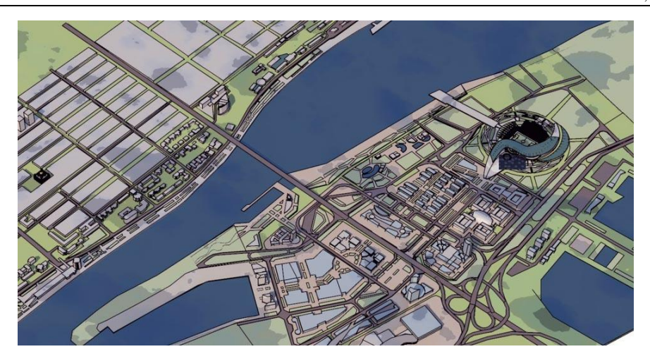
Fig. 2: 3-D model of new development around the stadium on the left bank of Don River

The left bank development conflict with the theory of a compact city and has a risk of limited connection between both sides of river by existing and planned bridges. Infrastructure development on the left bank may cause multi-stored economy class housing construction while most workplaces will remain on the right bank of the river.