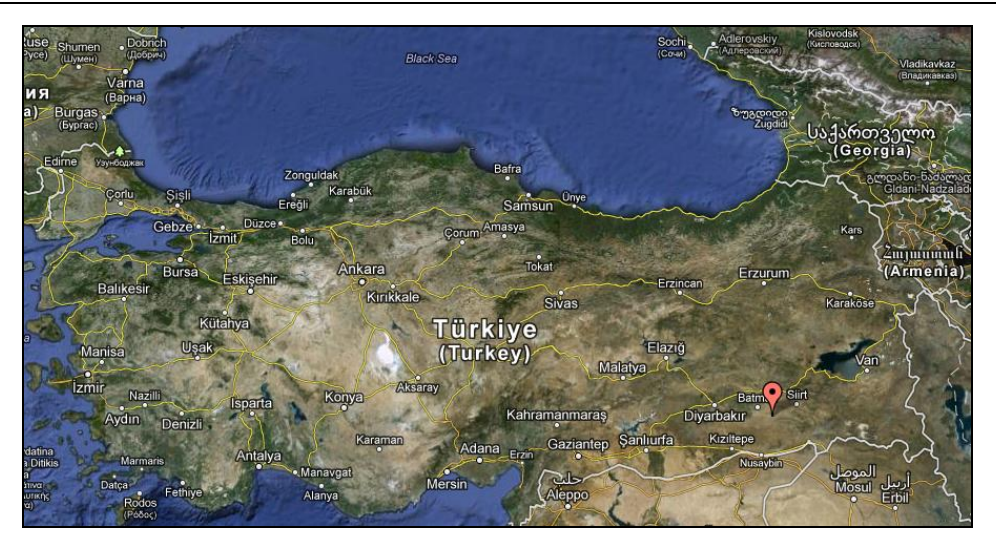
Figure 1. Location of Hasankeyf, the WHS in Turkey.

This unique and sensitive historical place is declared as first degree Conservation Area (CA) by the Republic of Turkey Ministry of Culture in 1978. Since then the 2005 United Nations Education, Science and Cultural Organization (UNESCO) Operation Guidelines set out the generic key qualities of the unique World Heritage Sites which are also valid for the Hasankeyf CA. The function of UNESCO is to protect and preserve the cultural and natural heritage properties which were developed by different cultures and civilizations through the human history and enlighten the different phases, stages, richness and differences of this common past, by drawing attention on the fact that these properties are increasingly in danger due to not only conventional destruction but also the changing social and economic conditions.