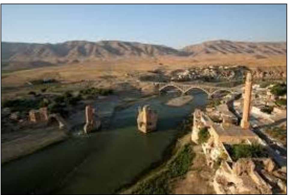
Figure 2: Settlements of Hasankeyf.

This unique and sensitive historical place is declared as first degree Conservation Area (CA) by the Republic of Turkey Ministry of Culture in 1978. Since then the 2005 United Nations Education, Science and Cultural Organization (UNESCO) Operation Guidelines set out the generic key qualities of the unique World Heritage Sites which are also valid for the Hasankeyf CA. The function of UNESCO is to protect and preserve the cultural and natural heritage properties which were developed by different cultures and civilizations through the human history and enlighten the different phases, stages, richness and differences of this common past, by drawing attention on the fact that these properties are increasingly in danger due to not only conventional destruction but also the changing social and economic conditions.