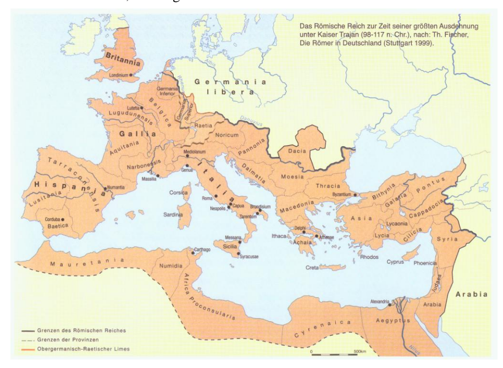
• Fig. 2: The route of the Roman Limes at the time of its greatest expansion around 117 A.D.

Development of hiking and bicycling paths along the Limes.