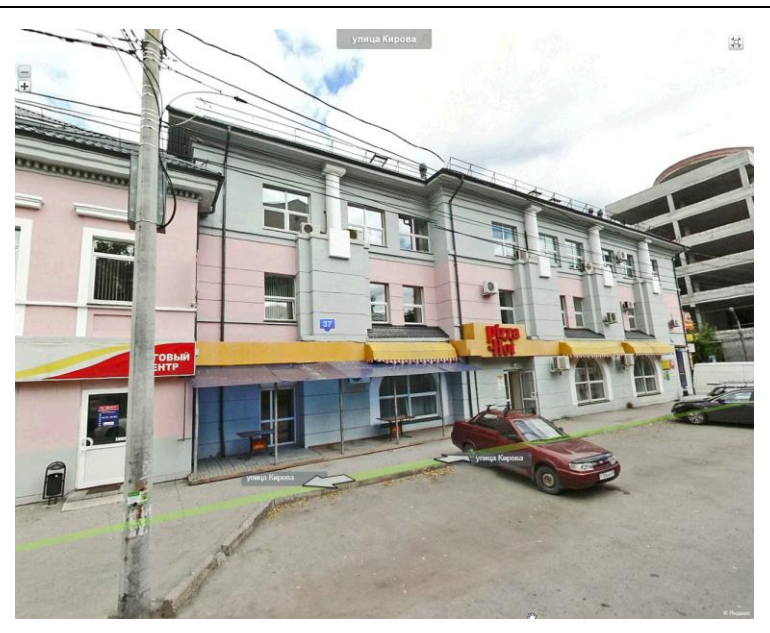
Fig.4 Façade of building, Kirov street.

In the survey of blocks of buildings of the XIX century one more problem of historical part of Perm was defined.