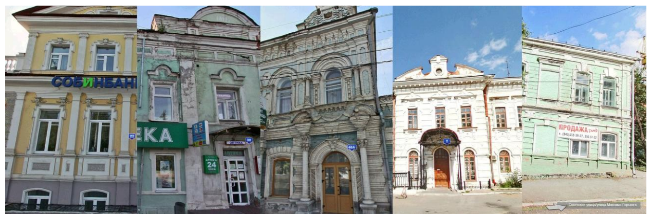
Fig.2 Fragments of facades of historical part of Perm

The quarters with such buildings are closed blocks. Administrative offices and commercial activity are situated on the street-side, but the accesses for people living in these buildings are inside of the quarter.