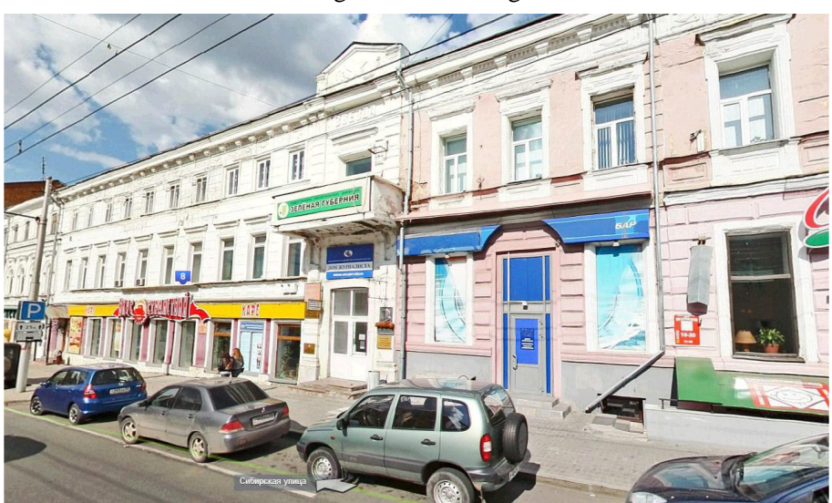
Fig.3 Façade of building, Sibirskay street.

Sibirskaya and Kirov streets are the main streets of Perm. The visual analysis of facades of these streets revealed that additional functions seem to be a great disadvantage and harm for historical buildings.