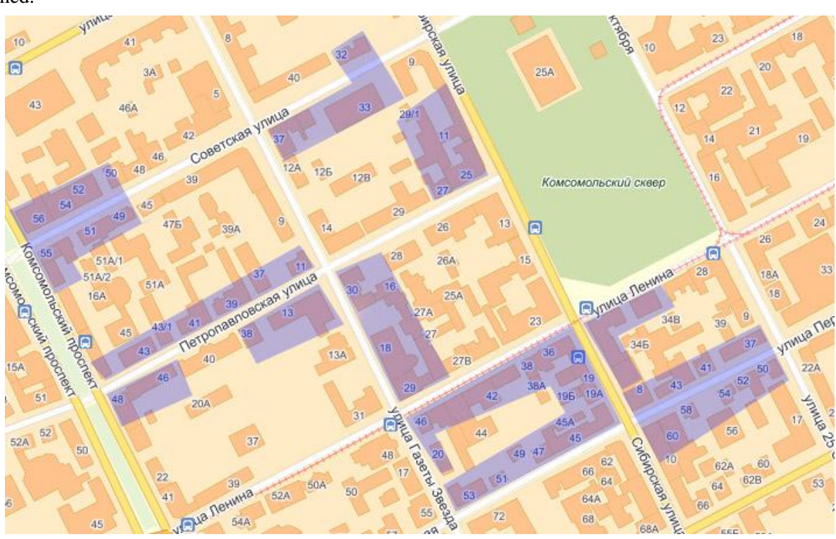
Fig.5 The revealing of blocks of historical buildings. The central part of Perm (2Gis map).

In the survey of blocks of buildings of the XIX century one more problem of historical part of Perm was defined.