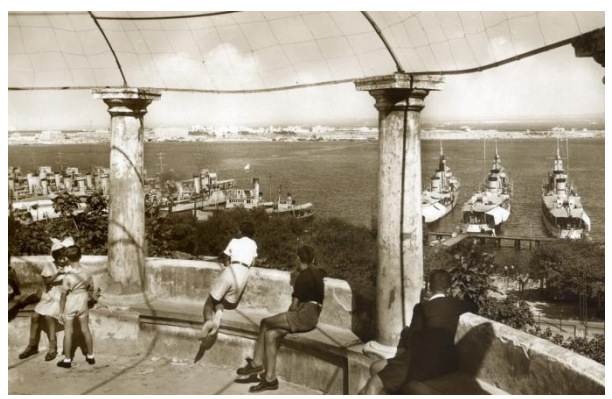
Fig. 4: Terrace overlooking Mar Piccolo, probably around 1930.

Historical research has revealed that park was initially designed (around 1860) as a belvedere/viewpoint. It overlooked the "Mar Piccolo", the bay to the north-east. There were probably two terraces, at least one of which can still be seen on a historical photograph (cf. Fig. 4).