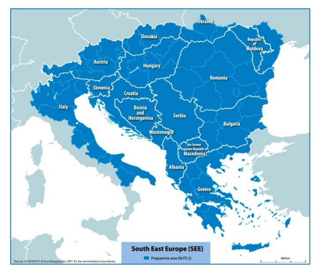
Fig. 1 SEE Programme Area

Therefore, quite generally, correlations must be established from the facts to see and understand the open space in its historical, spatial and social context. Hence the view to the outside is not only essential and substantial for the purposes of monument conservation; the environment also acts as an integrative component of the site on the inside (Böhme 1996).