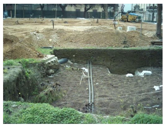
Fig. 2: The excavation site before the construction of a toilet facility for the open-air theatre

This level can be marketed for tourist purposes through the existing images of the historical mosaics.