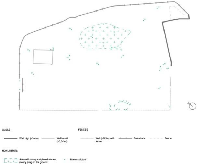
Fig. 6: Walls, fences, monuments of the Villa Peripato

Through the analytical method of mapping it became apparent that a significant number of landscape architecture traces and historical garden remains can still be found in a particular section of the park.