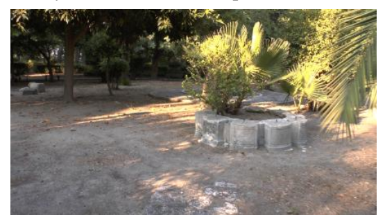
Fig. 7: Video still: Historical fragment in the remote section of the park of the Villa Peripato

In the Italian "Giardino Publico" of the Villa Peripatothe experimental analysis process using video footage has shown that the specific section of the park where numerous historical fragments are located is precisely the section which has a very withdrawn, remote character with an intimate atmosphere. Hence, a future presentation of the testimony to the historical significance of the park could be realised in this section of the site, since it also offers the opportunity for an unobstructed pursuit of the tracks of the cultural heritage.