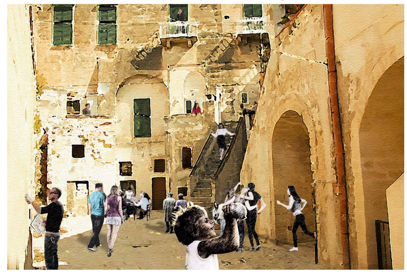
Fig. 2: Social life in the "urban neighbourhood".

You can therefore say that the idea of looking today at the Sassi as a potential Smart City starts essentially from its particular dense morphology, that before any other device imposed from the top, would encourage the development of a balanced lifestyle among the most modern housing needs and the traditional social vocation of the historic city made of rich and meaningful human relationships.