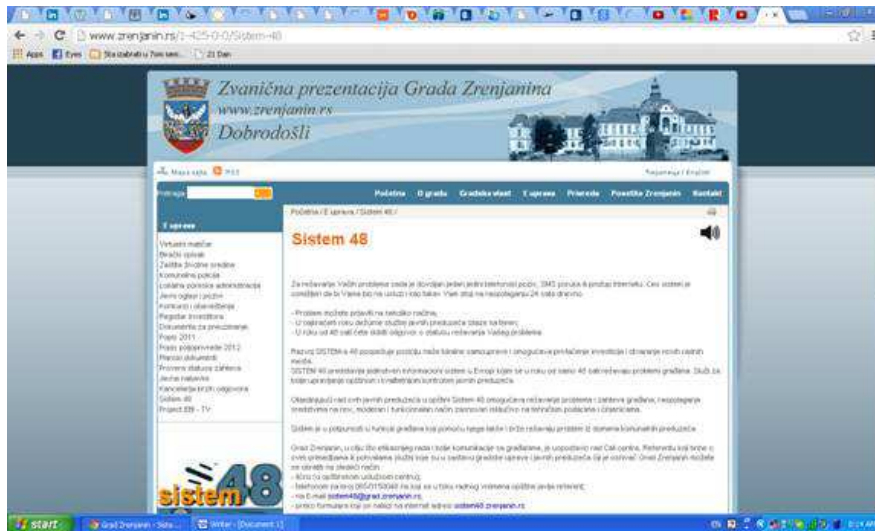
Fig. 3: City of Zrenjanin, web-presentation: 'System 48' - a user-friendly service of e-government, which enables interaction between citizens and all institution founded by the city.

The city of Zrenjanin has also established a mode of e-government. The web-site of the city administration includes a section related to planning documents containing all levels of plans - from the Regional and Master plan, to the plans of general and detail regulation of urban zones. The documents (textual files and drawings) could be downloaded from the site by all interested parties. The site also incorporates two interesting services - 'The office of quick responses' and 'System 48'. The first one provides information about urban sites/locations, including the data about potentials and limitations of a particular building lot, defined by the planning documents. The 'System 48' is used for communal problems, which could be reported by phone, text messages or Internet. It interlinks services of all public institutions founded by the city of Zrenjanin, enabling efficient response to identified urban problems and demands of citizens, as well as facilitating their solution. The system is active non-stop and within 48 hours all users receive a status report about the activities related to the problem.