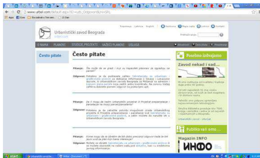
Fig. 2: Town Planning Institute of Belgrade, web-site: frequently asked questions related to different aspects/problems of urban development (e.g. planned activities and capacities, procedures, public presentations of plans etc.)

During the preparation of the Master plan of Belgrade in 2003, public participation was also included into the first phase of the process. The conceptual phase used the method of 'random participation', targeting all interested parties. Several hundreds of Belgrade citizens communicated with a special team in charge for the preparation of Master plan, using various media - from phone calls, to emails. After the completion of the second phase (and before the official approval of the plan), citizens also participated in the public meeting which gave them a detail insight into the document. Although majority of citizens were mostly interested in small-scale interventions i.e. a level of their own lot or building, approximately one-fifth of the present citizens was interested in the problems of public good, giving a number of useful ideas and suggestions related to crucial urban issues - green network, urban infrastructure, main bridges, articulation of river banks, protection of certain areas and buildings, quality of the environment.