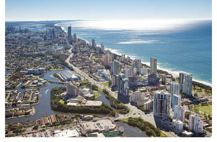
Fig. 2: Aerial view of Gold Coast

The paper now identifies key opportunities and challenges for developing Gold Coast into a smart city under the five identified themes of the smart city framework. The discussion below is based on critical understandings of the city's existing context as well as various policies of local and state governments.