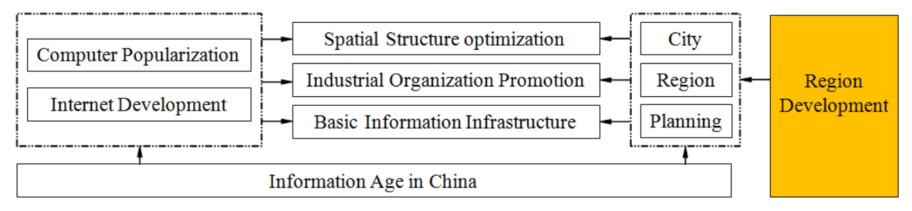
Fig. 1: The relationship between information background and regional development

At the age of informatization, various aspects of region will change and development as well. From three aspects, which is spatial structural optimization, industrial organization promotion and basical information infrastructure, authors elaborates the Chinese present situation of regional development.