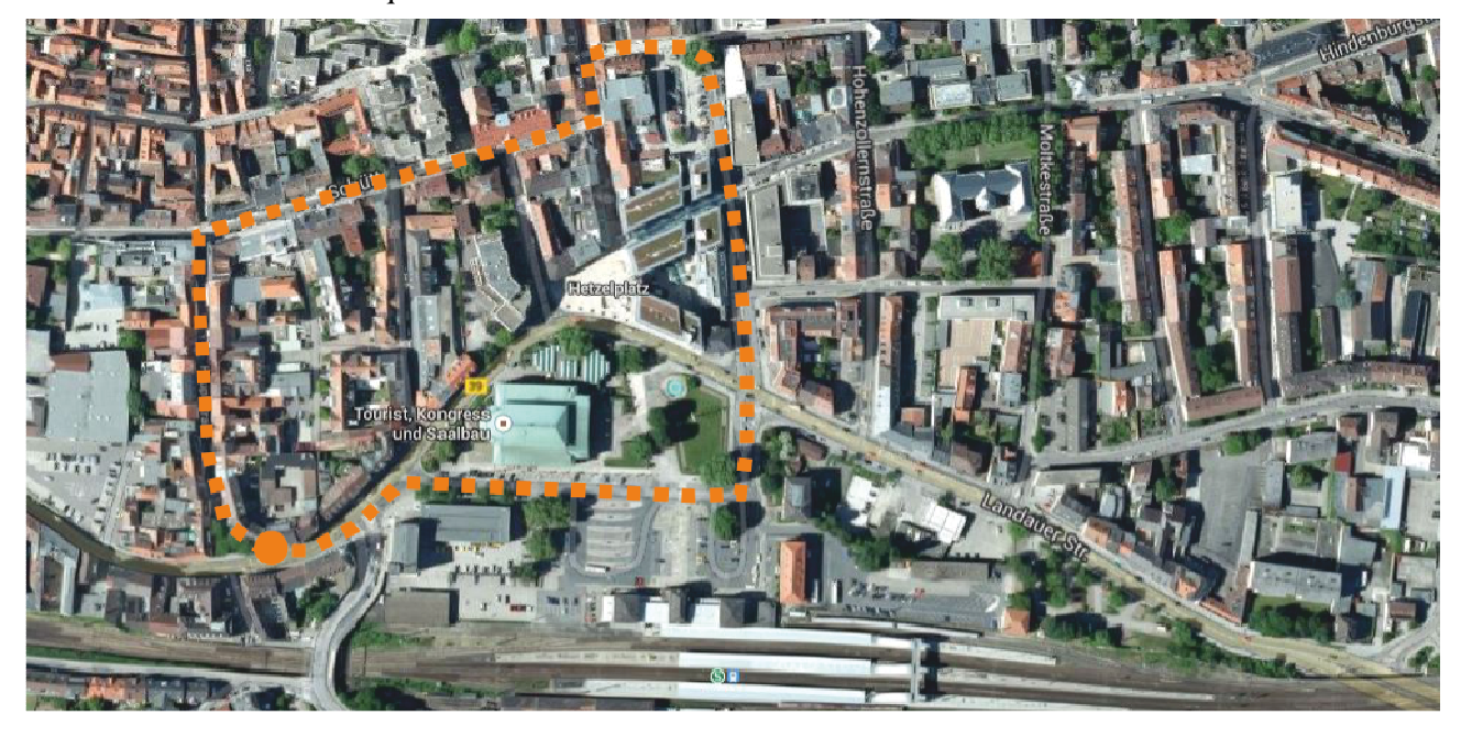
Figure 3: Study testbed Neustadtwith path (Google Inc. 2015)

The project was set up in cooperation with two cities in the German Federal State of Rhineland-Palatine. The validation of the platform and the results occurs in cooperation with the city of Neustadt an der Weinstraße and the city of Pirmasens based on different scenarios. Both areas are close to the city center and where chosen due to the possibility to create a varying test walk for the test persons with their devices. One of the goals of the project was to show the external impacts of the urban environment to the human body and so the test person's walks were designed, to embrace a variety of urban situation like traffic noise, traffic crossings and in alternation to it also quiet areas.