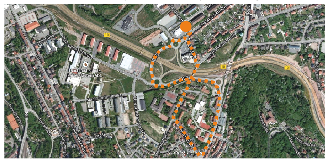
Figure 4: Study testbed Pirmasens with path(Google Inc. 2015)

to the trainstation square which will bring them in a more silent situation. After this section, the path leads towards north, with an additional crossing of B39 and the following walk towards the pedestrian area.