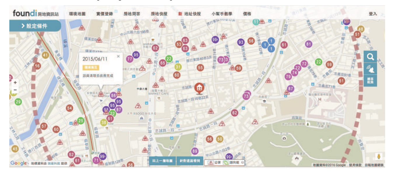
Fig. 1: The website of Housing Prices. (http://www.foundi.info/)

• Constant interpretation and re-interpretation. Open data is the basic foundation, but information will be shared more easily by some people who interpret it. The information on Internet will be edited, trimmed, supplemented, altered or changed into different form, and the entire context will be preserved as long as it • does not get deleted. During the sunflower movement in Taiwan, the topic had been noticed because of information on new network media, as well as alternative interpretations by the internet users, bringing about more re-interpretations. At the beginning, a professor of economics from National Taiwan University tried to explain the CSSTA and how it can affect business in Taiwan.<sup>4</sup> During the movement, that document became an important theoretical basis for