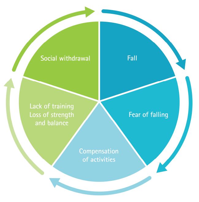
Fig. 1: Post-fall-syndrome.

Such falls can set up a negative cycle called post-fall syndrome. Once an elderly person suffered a severe fall, the fear of falling anew is rising and self-confidence in their own physical abilities is reduced. Walking and cycling is then associated with anxiety and insecurity. Thus, all situations that appear risky or uncomfortable are avoided. If a person is untrained this leads to less activity and as a consequence to a deplation of the interaction between muscles and nerve system. This is manifested in angular, tense, and insecure movements. Subsequently, less movement leads to a further decrease of muscle strength and balance which in return results in even more uncertainties. At the end of this negative cycle stands the loss of daily living skills and social isolation.