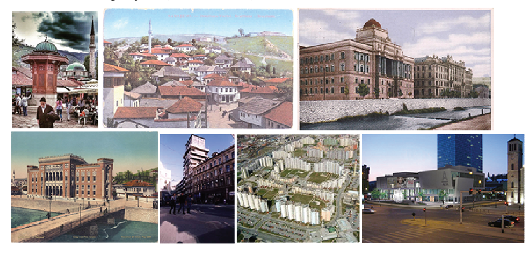
Fig. 2: Reading Sarajevo's development history along the valley (Tabori, 2017)

Sarajevo, as a part of former Austro-Hungarian Monarchy, got its first Building Code in 1880 (Fig. 3), followed by a second Building Code in 1893. Ever since then, the Building Code Document is missing in Sarajevo's spatial regulative, which resulted in unclear building procedures and urban "cacophony". In 1932, there was an attempt to make a unified Building Code for all cities in former Kingdom of Yugoslavia, but it failed. The last valid Building Code for Sarajevo was from Austro-Hungarian period, which was set at the same time as in Vienna. For the comparison, since then Vienna has novelized its Building Code about 60 times, sometimes four times per year (Geuder, 2016).