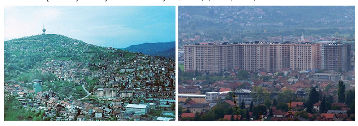
Fig. 4: Uncontrolled settlement development in Sarajevo (Uruci, 2017)

After the Bosnian war in the 1990s, the sociopolitical and spatial development opportunities of Sarajevo have become more complex and limited by the new administrative structure and the division of the city settlement area in local, cantonal and entity units (Korijenić, 2015). On the other hand, Sarajevo continued to attract new population as a capital city, which it has become after the war. Population migrations have accelerated the transformation process of the city and it's uncontrolled settlement area growth, which negatively affected its net of infrastructure, as well as, the city's image and its quality of living (Fig. 4) (Arhiv Zavoda za planiranje razvoja Kantona Sarajevo, 2015) (Uruci, 2017).