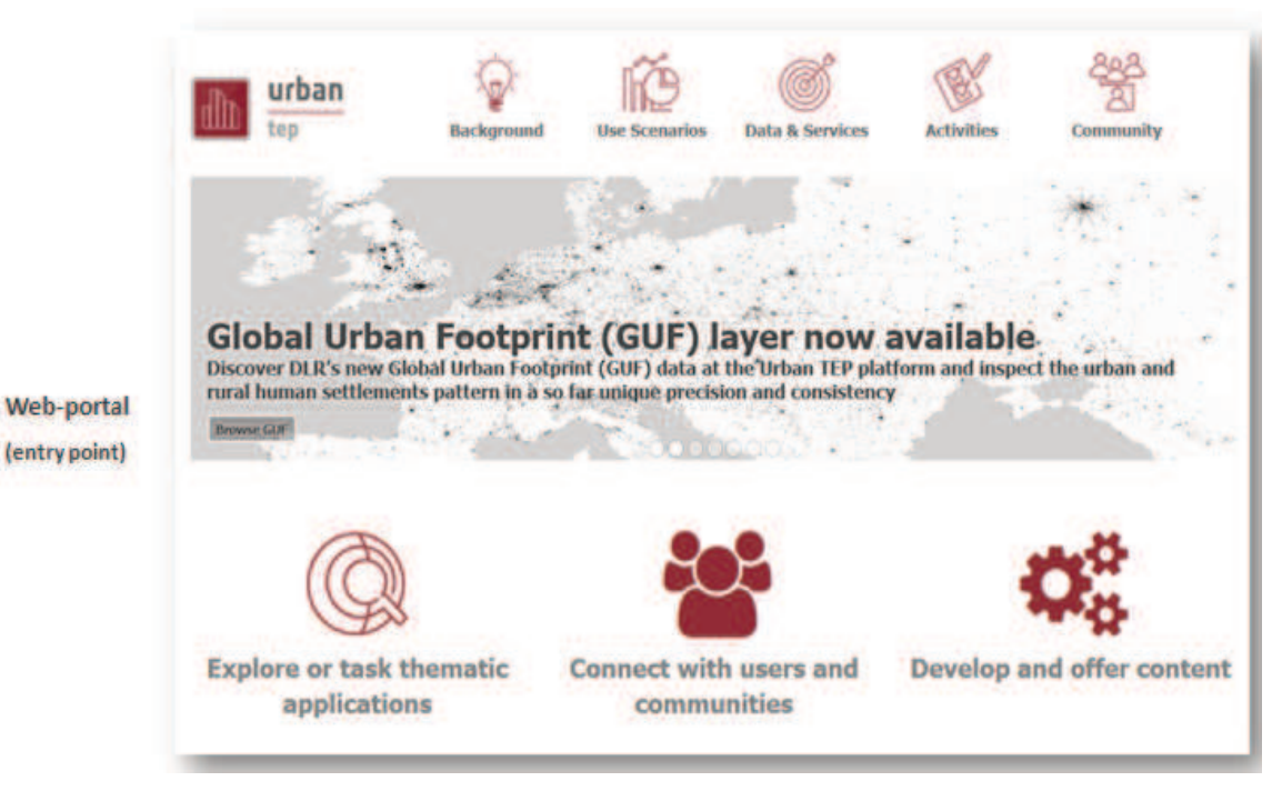
Fig. 1: U-TEP web-portal (https://urban-tep.eo.esa.int) serving as entry point to the system.

It is important to mention that the U-TEP platform is not designed to access EO data directly, and therefore, does not perform as a classical data distribution tool.