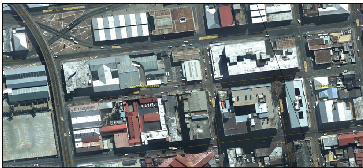
Figure 2: City and Suburban area.

The Maboneng precinct area has over time experienced a lot of changes. Before Maboneng, City and Suburban was mainly made up of industrial, warehousing, man hostels and clothing factory land uses. It was similar to the inner-city and had poor socio-economic conditions, was poorly maintained, with low levels of safety and poor levels of public space as illustrated in Figure 2.