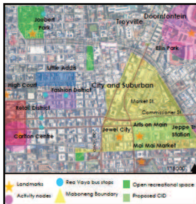
Figure 1: Maboneng Precinct boundary in yellow.

Maboneng which is a Sesotho word meaning “place of light” and was named such by its founder Jonathan Liebmann who felt that the area represents an enlightened community (Propertuity , 2016). As seen in Figure 1, Maboneng precinct is found in the east of the Central Business District (CBD) of Johannesburg and is bordered by Main street, fox street and Berea street (Propertuity , 2016). It lies south of Ellis Park stadium with Commissioner street running eastwards from the CBD to Maboneng precinct (Nevin, 2014).