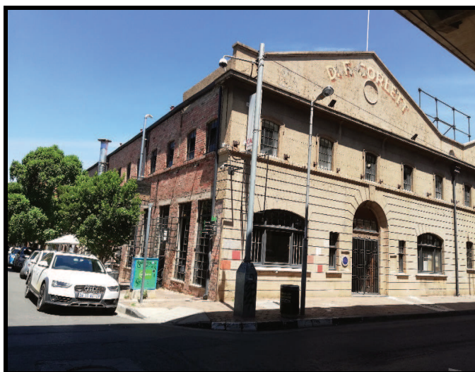
Figure 4: Arts on main buildings.