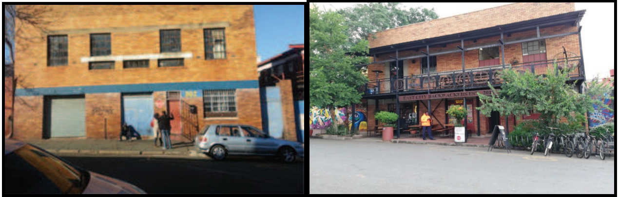
Figure 6: Curiosity backpackers before and after renovations.