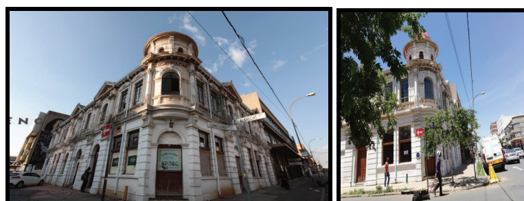
Figure 5 Cosmopolitan hotel in 2014 before renovations on the left and after renovations in 2018 on the right.

The Cosmopolitan Hotel as seen in Figure 5 is situated on corner Commissioner and Albrecht street in the Maboneng Precinct area. This building was built in the 1800's and it use to be a hotel, it has over the years had various changing uses, it eventually was dilapidated as seen in Figure 5.on the left side taken in 2014 before the building was renovated (Mason, 2014). However, between 2014 to 2018 the Cosmopolitan hotel has experienced a few changes as pictured in figures 5 on the right side.